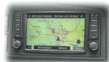
MAN MMT2 monitor

Interface to connect up to 3 pcs MXN camera (with or without motorized shutter) at MAN MMT2 monitor .