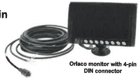
Orlaco monitor with 4-pin DIN connector

Interface to connect up to 2 pcs MXN camera (with or without motorized shutter) at Orlaco monitor with 4-pin DIN connector.