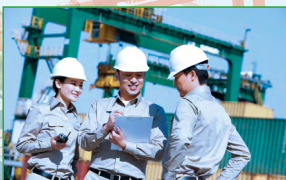
Port & Airport

PH600/PH660 is a cost-effective DMR radio with compact design, friendly GUI, large battery, excellent sound quality, making it deployable in all commercial industries.