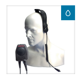
CXR5/DT9 Bone conductive skull mic with in-line PTT