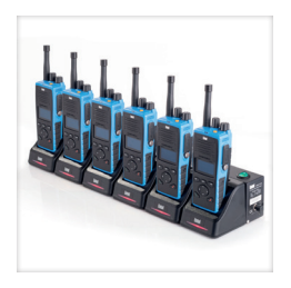
CSBHT Intelligent six-pod rapid charger

Supplied package includes: Li-ion battery pack, drop-in charger, belt clip, high-efficiency antenna and quick-start user guide.